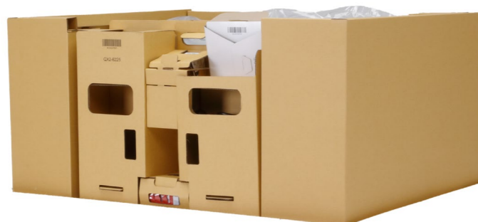
EPS-free packaging for TM series